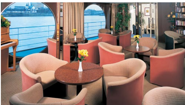
✦ Panoramic views in the library