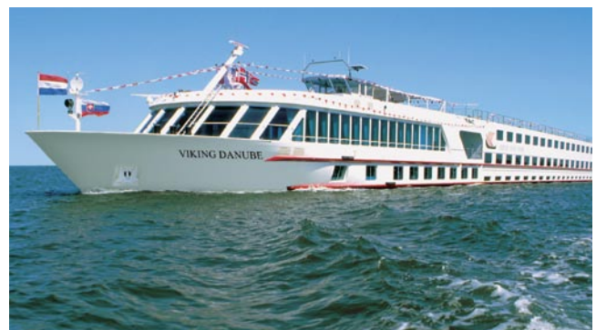
✦ Viking Danube