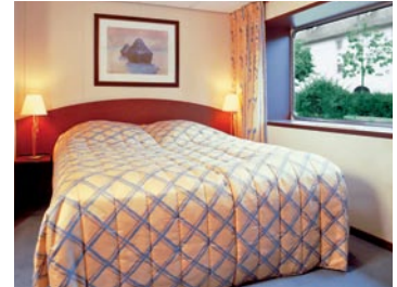
Pictured: Category A, B or C stateroom

Deluxe Stateroom (All Categories) 154 sq. ft.