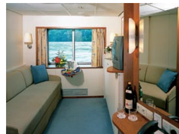
Pictured: Category A or B stateroom

Standard Stateroom (All Categories) 120 sq. ft.