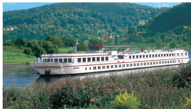
✦ Viking Fontane sailing the Elbe