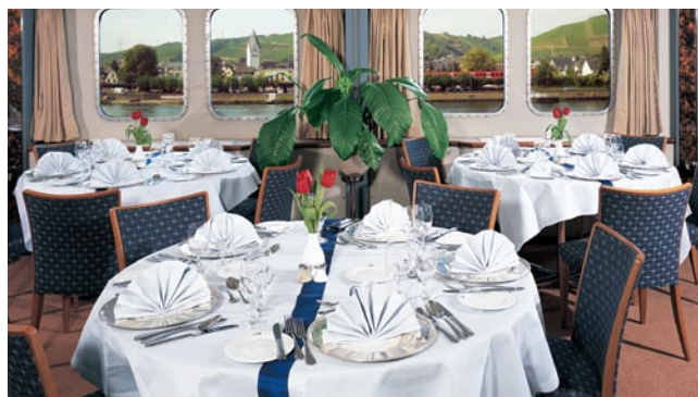
✦ Enjoy meals in the restaurant with panoramic windows